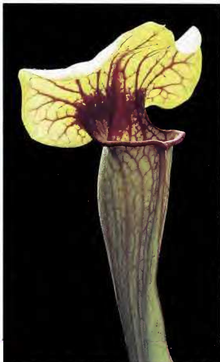
Figure 2: Sarracenia 'Abandoned Hope', photo E.M. Salvia.